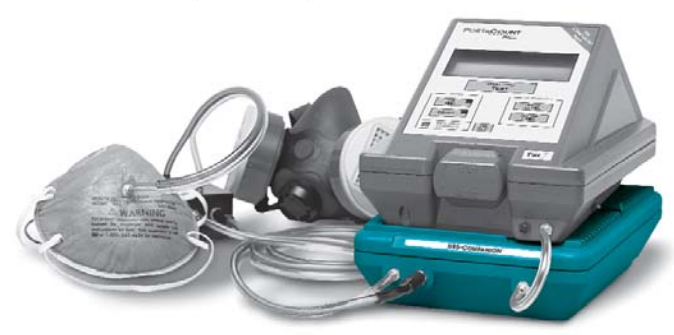
Model 8028 PORTACOUNT Universal Fit Test System PORTACOUNT Plus Model 8020 and N95-Companion Model 8095 together let you fit test any tight-fitting respirator.