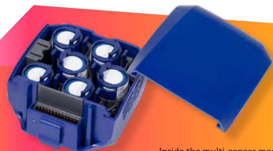
Inside the multi-sensor module