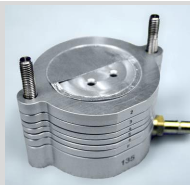
Figure 1. Stage body design

The Models 135-6 and 135-8 can be used with personal sampling pumps since they have a low pressure drop. The Model 135-10 requires a vacuum pump due to the larger pressure drop associated with the last two stages.