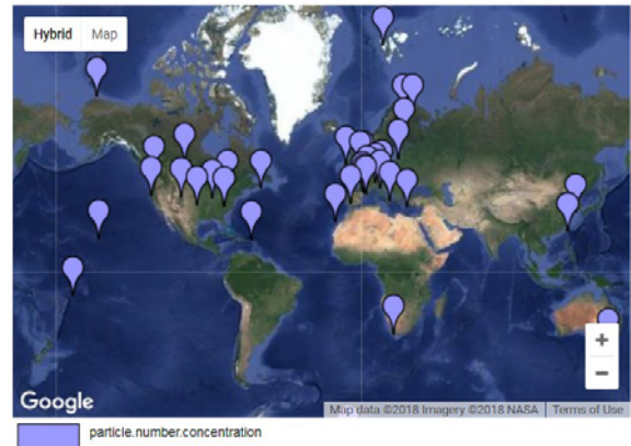
Figure 3: Map of datasets for particle number concentration measurements obtainable via the ACTRIS network.

Going beyond national-level efforts, ACTRIS is an EU-level data center providing access to concentration measurements of dozens of atmospheric constituents, including particle number concentrations and size distributions. Number concentration datasets originating from five continents can be accessed through ACTRIS at http://actris.nilo.no . A map of available datasets for particle number concentrations is shown in Figure 3.