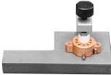
Figure 3. Model 200 Personal Impactor in Clamping Device