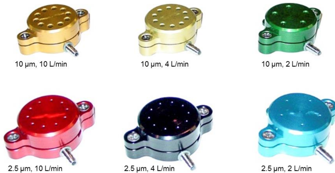
Figure 1. Personal Impactor Configurations

Six versions of the Model 200 Impactors are available from TSI Incorporated. There are two impactor cut sizes, either 2.5 \mu\text{m} or 10 \mu\text{m} aerodynamic diameter, and each particle cut size can be achieved at three different flow rates: 2, 4, or 10 L/min. The specific cut size and flow rate for each impactor configuration are stamped inside the nozzle cap. Figure 1 below shows the six impactor versions. Each impactor version is manufactured in a different color to facilitate proper identification by the user.