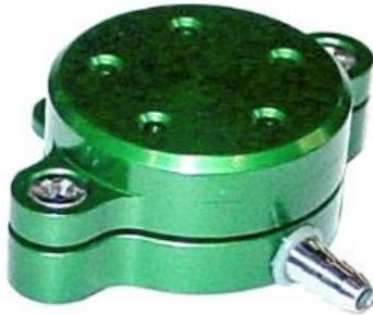
Figure 4. Assembled Model 200 Personal Impactor