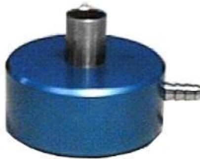
Figure 5. Flow Calibration Cap