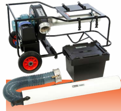
Carry Weight: 99 lbs (45 kg) with Instrument Box and Flex Carrying Tube Removed.

Specifications are subject to change without notice.