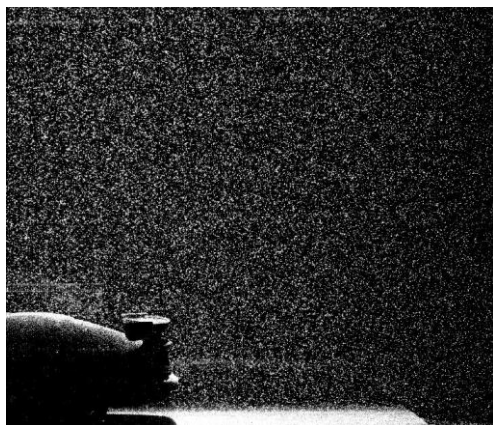
Fig. 2: Sample image from one of the V3V-8000 apertures.

In this experiment, the flow covering the entire region behind an automobile model was taken. The objective is to investigate the flow behavior in the volumetric region. With the employment of the V3V system, the instantaneous flow characteristics were revealed, showing wake flows behind the mirrors and the trailing flow toward the rear end of the model. Overall the measurement provides a holistic view of the flow behavior; hence it can facilitate changes on the automobile body and various parts to meet the aerodynamics requirement for the design.