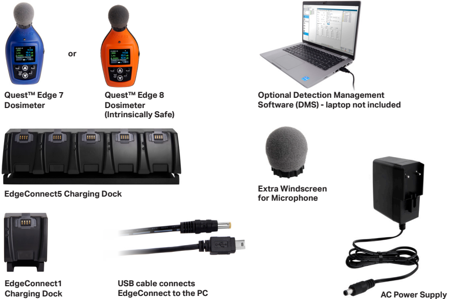
Figure 2-1: Identifying your equipment

(For more information on parts/accessories, refer to tsi.com )