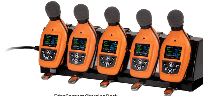
EdgeConnect Charging Dock