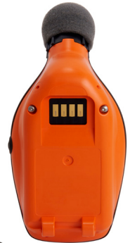
Backside of Edge