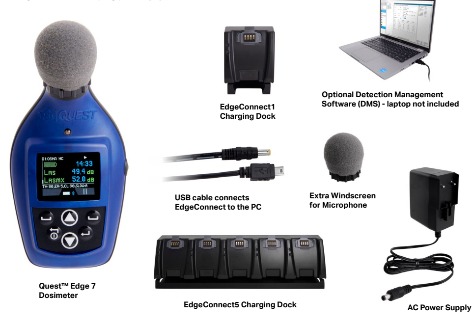
Figure 2-1: Identifying your equipment

NOTE: Depending on the accessories you selected, the dosimeter may have the following components. For the charging dock, you will either have an EdgeConnect1 or an EdgeConnect5. (For more information on parts/accessories, refer to tsi.com)