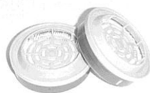
P100 Bayonet Filters (MSA p/n 815369)