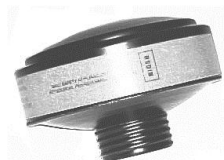
P100 Filter (40 mm)