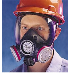
MSA Advantage 1000