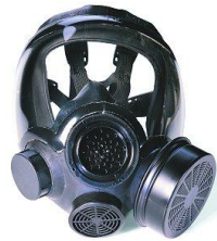
MSA Advantage 1000 CBA-RCA