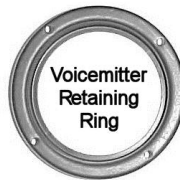
Voicemitter Retaining Ring