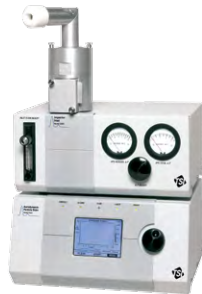
The Model 3306 with standard throat installed is shown atop a Model 3321 APS spectrometer. The spectrometer is sold separately.

Specifications are subject to change without notice.