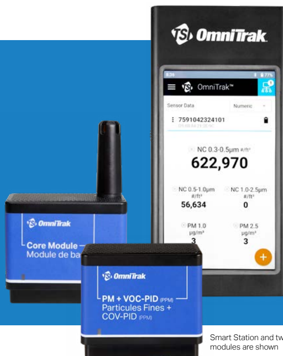
Smart Station and two modules are shown