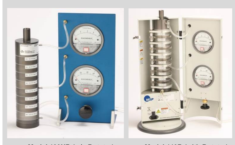
Model 100NR (w/o Rotator)