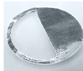
Figure 2. Impaction substrate