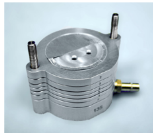
Figure 1. Stage body design

The stages are designed to prevent cross-flow interference between adjacent nozzles. The result is sharp cut-size characteristics not available with other cascade impactors that are less well designed aerodynamically (Figure 3).