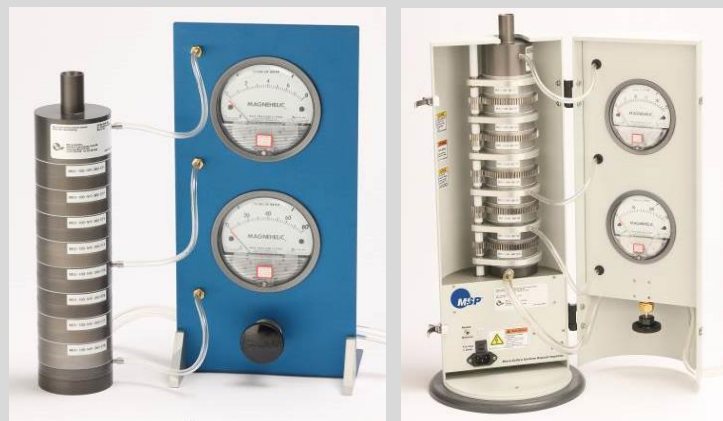
Model 100NR (w/o Rotator)