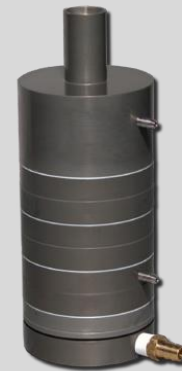
Model 100-S4 3-Stage MOUDI

For environmental air sampling, a special 4-stage MOUDI impactor is available. The Model 100-S4 has an 18 µm inlet, followed by cut-point stages at 1.0, 2.5, and 10 µm, and a final filter. This particular combination of MOUDI stages is useful for ambient PM 1.0 , PM 2.5 and PM 10 measurement in special research applications.