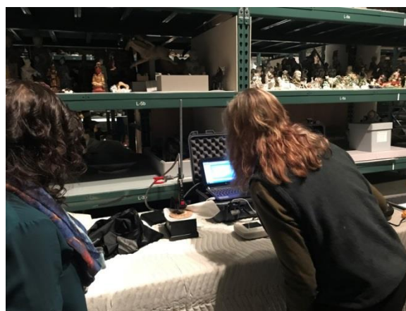
Figure 2. Measurements on the mirror with TSI ChemLogix EZRaman-NP.