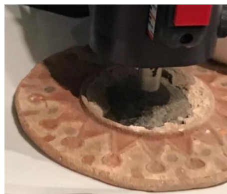
Figure 1. Roman terracotta piece, likely an architectural mirror.

The interior circle nearest the glass insert has a raised rim. Around the interior edge (over the glass), there is a layer of white material, possibly plaster. It is unclear whether this is original. Around the interior circle are molded triangles with dots at the peaks that create a sunburst design. These are painted red and in between each are a black dot and a red stripe. The outside edge is slightly irregular as is the essentially flat back. The back has fingerprints from the artist who pressed the clay into a mold to create the front. There is one small hole that originally went through the piece near one of the black painted dots. It is now blocked with clay.