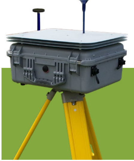
Shown with Surveyor's Tripod and Heat Shield (sold separately)