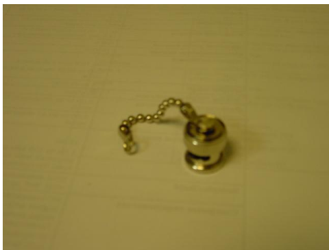
Fig. 1: Shorting Cap

The following photo shows a picture of the Shorting Cap: