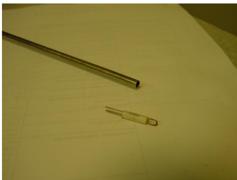
Fig. 1: Shorting Probe

The picture below shows the shorting probe: