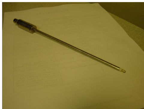
Fig. 2: Shorting Probe Installed

The shorting probe is used to determine the cable resistance.