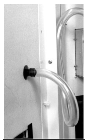
Figure 4: Back view of fascia

Older hoods may contain asbestos. ALWAYS take special precautions when dealing with this material.