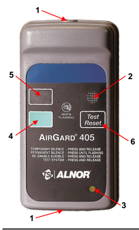
Figure 1: Front view of instrument