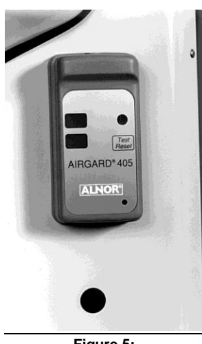
Figure 5: Typical installation

Calibration of this instrument should only be performed by qualified personnel. Proper guidelines for monitoring any ventilation apparatus are established on the basis of toxicity or hazards of the materials used, or the operation conducted within the ventilation apparatus. Personnel calibrating the AirGard<sup>®</sup> 405 monitor must be completely aware of the regulations and guidelines specific to their application.