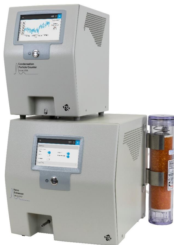
Figure 3: 1nm CPC system consisting of a Model 3757 Nano Enhancer coupled to a Model 3750 CPC

For complete specifications on the Model 3757 Nano Enhancer, 1nm DMA, and 1nm SMPS™ system see the 1nm specification sheet on www.tsi.com .