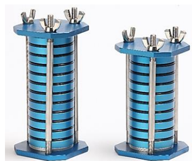
Figure 6: Spare Sets of Impaction Plates

This silicone spray is applied to substrates to minimize particle bounce. One can of the spray is included with all impactor purchases. Additional spray may be purchased using PN 0100-96-0559.