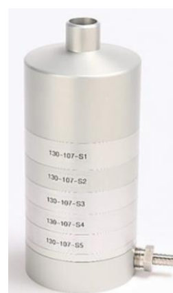
Figure 4: 130 High-Flow Cascade Impactor.

Refer to Table 2 and/or Figure 5 when selecting an impactor model. Please feel free to contact TSI® for support in selecting the impactor that is right for your needs.