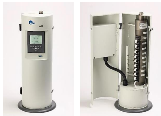
Figure 3: 120R NanoMOUDI™ impactor: exterior (left) and interior (right)

The impaction stages of the NanoMOUDI impactors rotate during sampling. This rotation results in the sampled particles being deposited over a wider area on the substrate, relative to non-rotating impactors.