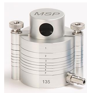
Figure 2: 135-6B MiniMOUDI™ Impactor, with optional cowl inlet installed

The MiniMOUDI™ impactors are ideal for personal sampling. They have a design flow rate of 2 L/min, which is supplied by a pump that can be worn by the user. The three models of MiniMOUDI™ have three different smallest cutpoints; users can go down to 0.56 µm, 0.18 µm, or 0.056 µm. Figure 2 shows the six-stage 135-6 MiniMOUDI impactor with the cowl inlet. This inlet is ideal for personal sampling; see the footnotes of Table 2 for more information on the available inlets for MiniMOUDI impactors.