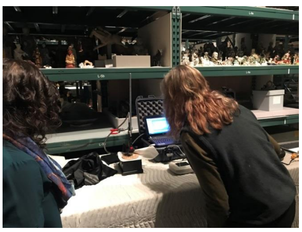
Figure 2. Measurements on the mirror with TSI ChemLogix EZRaman-NP.

TSI and the TSI logo are registered trademarks of TSI Incorporated. ChemLogix is a trademark of TSI Incorporated.