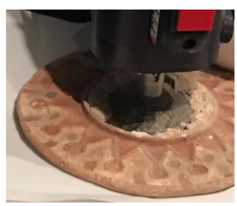
Figure 1. Roman terracotta piece, likely an architectural mirror.

The interior circle nearest the glass insert has a raised rim. Around the interior edge (over the glass), there is a layer of white material, possibly plaster. It is unclear whether this is original. Around the interior circle are molded triangles with dots at the peaks that create a sunburst design. These are painted red and in between each are a black dot and a red stripe. The outside edge is slightly irregular as is the essentially flat back. The back has fingerprints from the artist who pressed the clay into a mold to create the front. There is one small hole that originally went through the piece near one of the black painted dots. It is now blocked with clay.