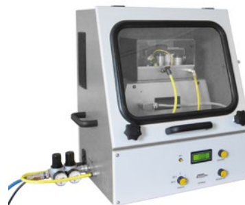
Model 3413U: Dust aerosol generator inside full enclosure for difficult powders