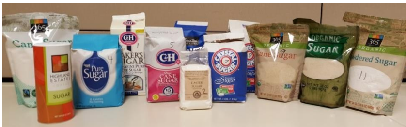
Figure 1. Sugar (sucrose) samples

In the first experiment, eleven different sugars (sucrose samples) were obtained from unique manufacturers and distributors. All the sugar samples were sucrose: C_6H_{12}O_6 . One of the sucrose samples, 365 Powdered Sugar, was first scanned