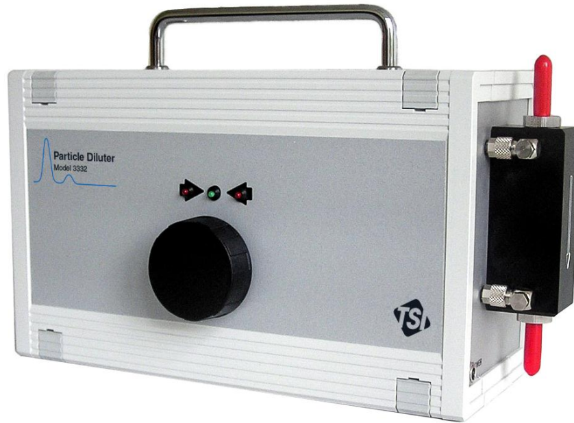
Model 3332 Dilution System

The indicator lights on the diluter indicate if the pressure drop across the capillary is what it should be (based on its calibration). If one of the red arrows is illuminated, an adjustment of the knob will restore the proper balance between the flows.