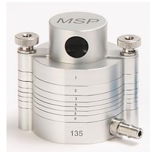
Figure 2: 135-6 MiniMOUDI Impactor

The MiniMOUDI<sup>™</sup> impactors are ideal for personal sampling. They have a design flow rate of 2 L/min, which is supplied by a pump that can be worn by the user. The three models of MiniMOUDI<sup>™</sup> have three different smallest cutpoints; users can go down to 0.56 µm, 0.18 µm, or 0.056 µm. Figure 2 shows the six-stage 135-6 MiniMOUDI impactor with the cowl inlet. This inlet is ideal for personal sampling; see the footnotes of Table 2 for more information on the available inlets for MiniMOUDI impactors.