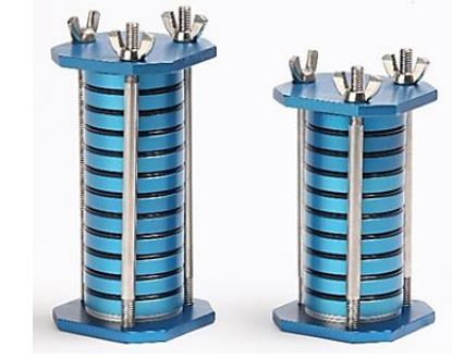
Figure 6: Spare Sets of Impaction Plates

This silicone spray is applied to substrates to minimize particle bounce. One can of the spray is included with all impactor purchases. Additional spray may be purchased using PN 0100-96-0559.