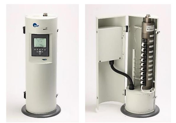
Figure 3: 120R NanoMOUDI impactor: exterior (left) and interior (right)

substrate, they can begin to accumulate, forming a three dimensional deposit under each nozzle. The formation of these deposits (each shaped roughly like a shallow cone, or pyramid) can deteriorate impactor performance by increasing particle bounce, permitting particle re-entrainment, and/or potentially clogging the nozzle.