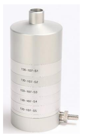
Figure 4: 130 High-Flow Cascade Impactor.

One unique feature of the high-flow impactors is that their nozzle plates are designed to facilitate a high degree of data quality for users who intend to conduct multiple offline analyses for each substrate. In such a case, it is commonplace to cut the substrate material into two or four equal pieces. To facilitate the equal division of substrates for this purpose, TSI® offers specially-designed nozzle plates with high-flow impactors. These nozzle plates distribute the nozzles symmetrically across the stage area in four quadrants, leaving a '+'-shaped area with no deposited aerosol.