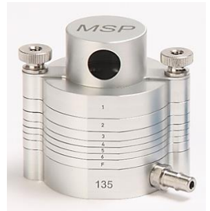
Figure 2: 135-6 MiniMOUDI Impactor

The MiniMOUDI™ impactors are ideal for personal sampling. They have a design flow rate of 2 L/min, which is supplied by a pump that can be worn by the user. The three models of MiniMOUDI™ have three different smallest cutpoints; users can go down to 0.56 µm, 0.18 µm, or 0.056 µm. Figure 2 shows the six-stage 135-6 MiniMOUDI impactor with the cowl inlet. This inlet is ideal for personal sampling; see the footnotes of Table 2 for more information on the available inlets for MiniMOUDI impactors.