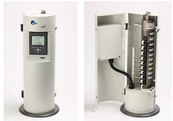
Figure 3: 120R NanoMOUDI impactor: exterior (left) and interior (right)

To understand why this is valuable, imagine a non-rotating impactor. As particles are collected on the collection substrate, they can begin to accumulate, forming a three dimensional deposit under each nozzle. The formation of these deposits (each shaped roughly like a shallow cone, or pyramid) can deteriorate impactor performance by increasing particle bounce, permitting particle re-entrainment, and/or potentially clogging the nozzle.