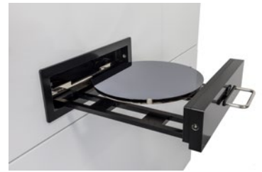
All versions can support deposition on 200mm and 300mm wafers