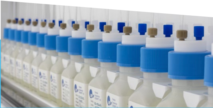
Up to 16 particle suspensions can be loaded for processing.

The MSP logo is a registered trademark of MSP Corporation. TSI and the TSI logo are registered trademarks of TSI Incorporated.