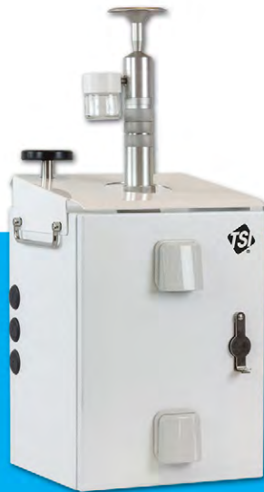
Environmental Dust Trak for 24/7 real-time remote dust monitoring