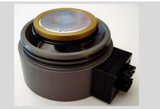
Figure 2. Typical stage with uniform deposit