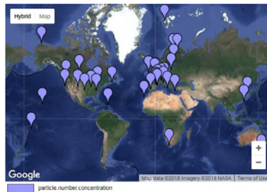
Figure 3: Map of datasets for particle number concentration measurements obtainable via the ACTRIS network.

Going beyond national-level efforts, ACTRIS is an EU-level data center providing access to concentration measurements of dozens of atmospheric constituents, including particle number concentrations and size distributions. Number concentration datasets originating from five continents can be accessed through ACTRIS at http://actris.nilu.no . A map of available datasets for particle number concentrations is shown in Figure 3.