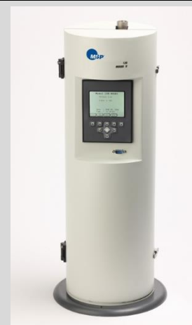
Model 125R 10 L/min 13 Stage MOUDI II impactor