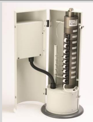
Model 120R 30 L/min 10 Stage MOUDI II impactor