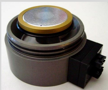
Figure 2. Typical stage with uniform deposit