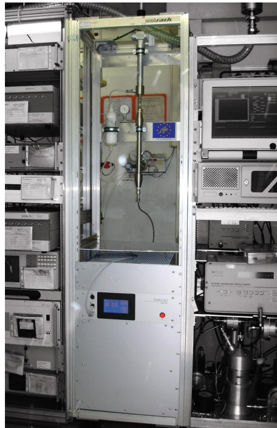
Figure 3. Model 3031 UFP Monitor with the Environmental Sampling System.